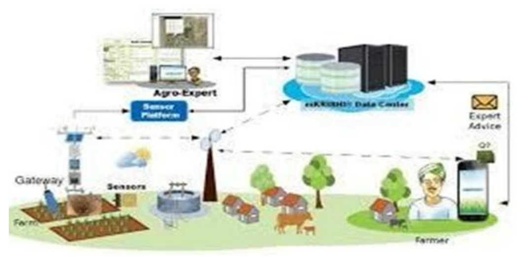
Fig. (Farm Platform)

Finally, animal health parameters, such as controlling infectious diseases, vaccination program and medication can be stored, so as to provide valuable information to the owners and to the vets of the holdings. Finally, a minimum set of animal identification data that can be used in order to identify the animal and its behavior can be stored on the RFID tag on the animal, provided that rewriting of the tag is possible. In this way, if an animal is found, the information about its identity, the farm where it belongs and some useful dataabout his behavior towards humans, other animals or premises can be read, thus allowing for proper handling of the animal.